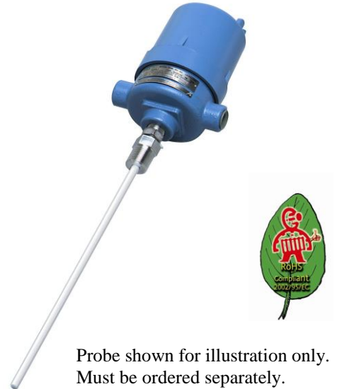
Probe shown for illustration only. Must be ordered separately.

The primary measuring circuit employs a patented Pulse Frequency Modulation, PFM, technology. The 12 VDC and 24 VDC rated units accept voltages from 9 to 18V and 18 to 36V, respectively, while the universal input AC powered unit accepts 100 to 240V. No jumper, or switch, changes are required.